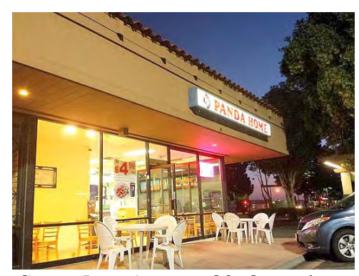
Saturday, August 30, 3pm-4pm (or ???)

To RSVP, please email: <u>BAMENClub+RSVP+0823@GMail.com</u>