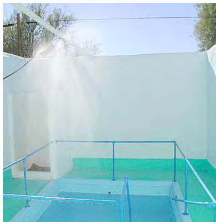
One of Delight's hot spring pools... Notice the shower in the back left.