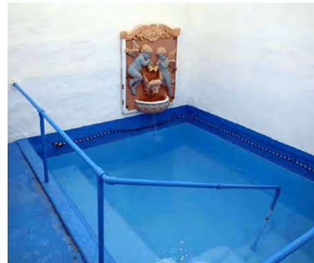
Another of Delight's pools.

Not only can you bathe in the very smooth waters of the natural hot springs in the area, but this trip will be the last chance of the year to view desert wildflowers along the way there and back, as well as having a lot of space to hike (nude if you want if you're on BLM (national) land, which is most of Tecopa!), and/or see the sights of a real, old-west ghost town, visit and sample the goodies at a date ranch (grows all but 3-4 of the world's types of dates - doesn't get cold