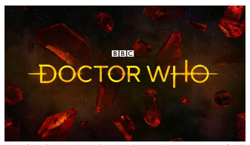
Wed. Oct. 17 6pm-10pm "Doctor Who" Season 11R Premier (commercial-free, in Garden Grove)