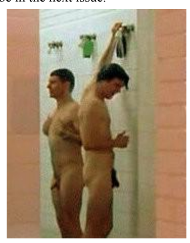
Issue 133 — December 2017 — Page 4 of 10

The answer to who the guy shown here is will be in the next issue.