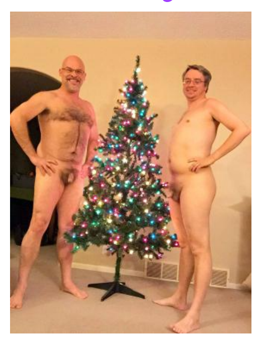
Saturday, December 16, 2-8pm Pre-Christmas/15th Anniversary Party w/Potluck w/movies, games, & more!

When/Cost/Where: 2pm-8pm 12/16, $5 requested at door, location near 17th/Westminster & Fairview or Harbor in Garden Grove on Santa Ana border. (No one will be turned away for lack of funds.)