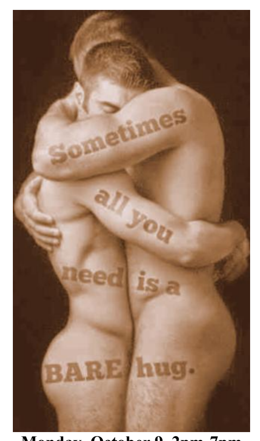
Monday, October 9, 2pm-7pm Touch Session with Massage Exchange & Body Scrubs w/Potluck

When/Cost/Where: 2pm-7pm 10/9, $5 requested at door, location near 17th/Westminster & Fairview or Harbor in Garden Grove on Santa Ana border. (No one will be turned away for lack of funds.)