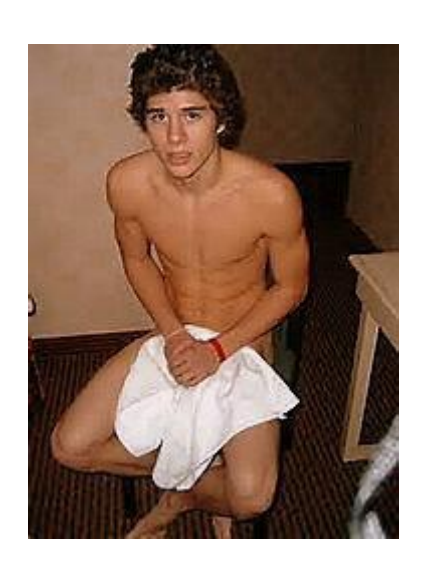
Thursday, October 12, 5pm-7:30pm WHYP-SoCal Event: Body Shyness Discussion/Workshop

When/Cost/Where: 5-7:30pm 10/12, $2 requested at door, location near 17th/Westminster & Fairview or Harbor in Garden Grove on Santa Ana border. (No one will be turned away for lack of funds.)