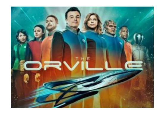
Every Thursday, 8-11pm Watch "The Orville" & "Will & Grace" Party

(This event will not take place if both shows will not air this week, so please check the TV schedule and/or check for cancellations with us.)