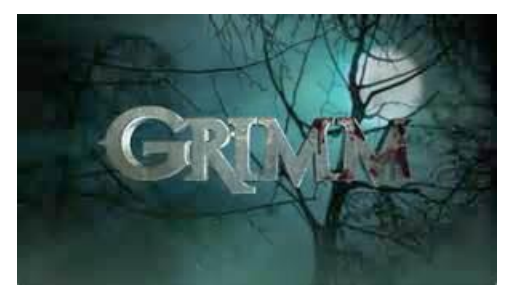
Friday, March 31, 5:00pm-10:00pm

"Grimm" Finale & Massage Exchange w/Potluck Dinner