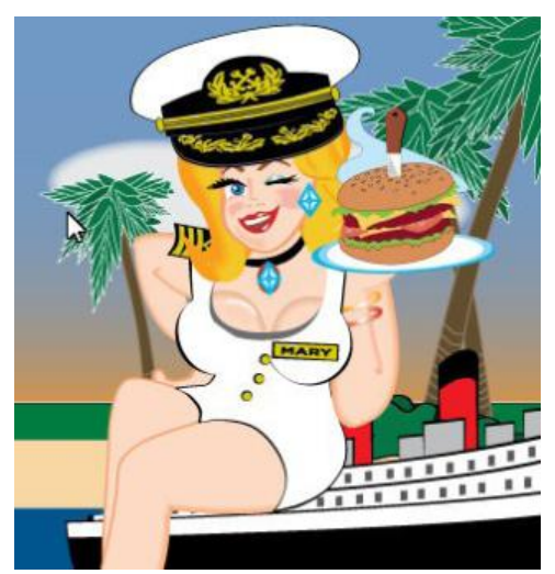
Friday, April 28, 7pm-???