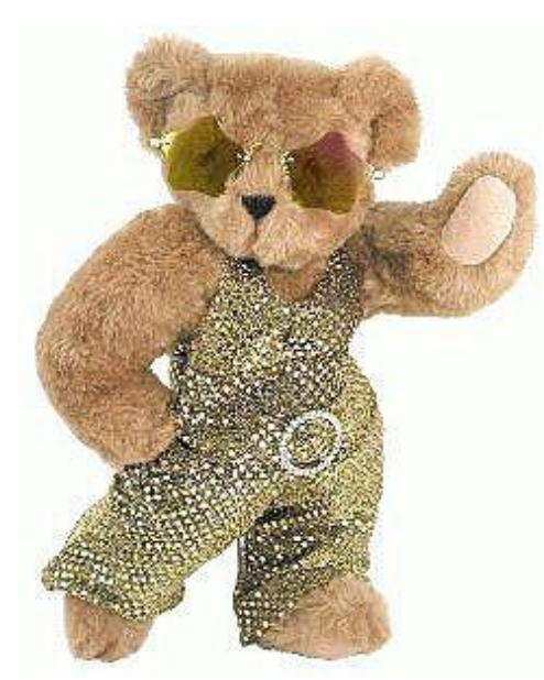
Saturday, April 22, 10pm?-???