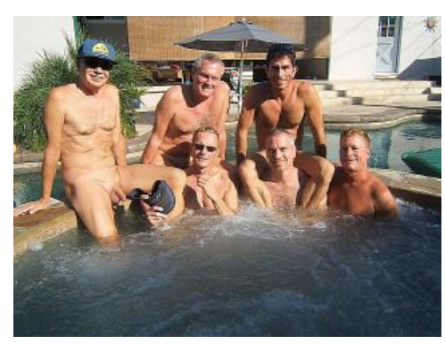
Saturday, August 13, 1pm-6pm