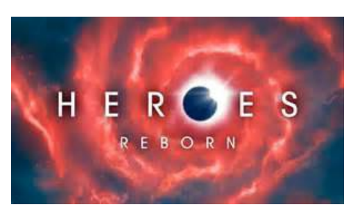
Thursday, November 12<sup>th</sup> & 19<sup>th</sup>, 6pm-11pm

RSVP at: <u>http://bit.ly/bamen-rsvp</u>