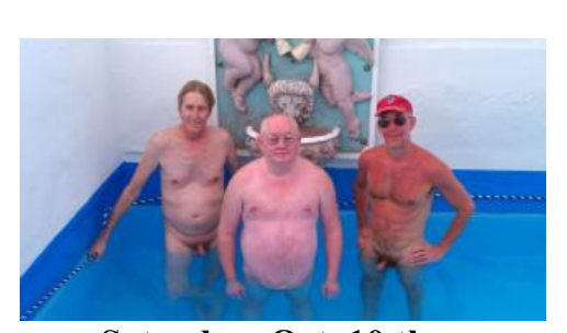
Saturday, Oct. 10 thru Tuesday, Oct. 13 Tecopa Hot Springs Soak &

RSVP at: <a href="http://bit.ly/bamen-rsvp">http://bit.ly/bamen-rsvp</a>