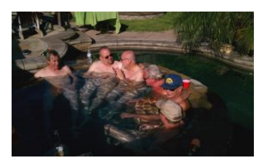
Saturday, September 19, 1pm-6pm Pool & Spa Party w/Potluck BBQ

*** RSVP's are REQUIRED if you wish to attend - DO NOT just show at the door, PLEASE! ***