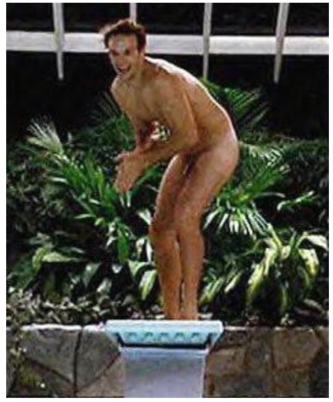
A hint: This Canadian-born actor has been in a number of movies and TV series, including "Supernatural" and "Stargate SG-1".

The answer to who the guy shown here is will be in the next issue.