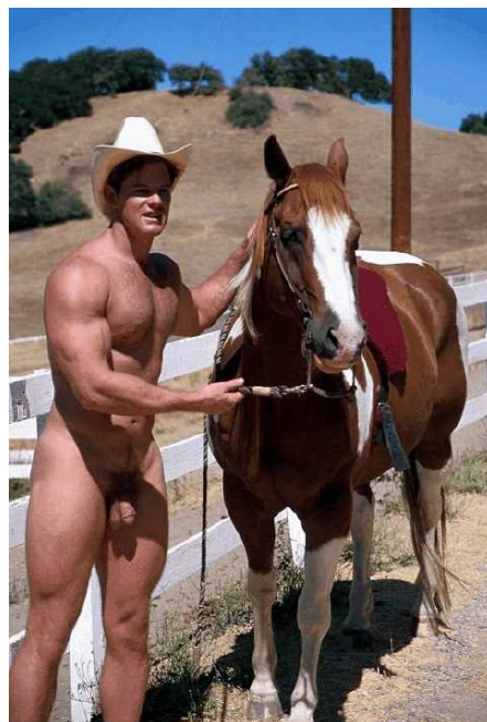
July 2006 — Page 3 of 4

Cancellations received after Noon 7/26 will only get a refund/credit if we've reached the minimum necessary to hold the event without you. —Sound fair?