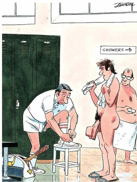
"Just to be safe, I keep my wallet and keys under my foreskin."

(If you cannot read the above, it says "Just to be safe, I keep my wallet and keys under my foreskin".)