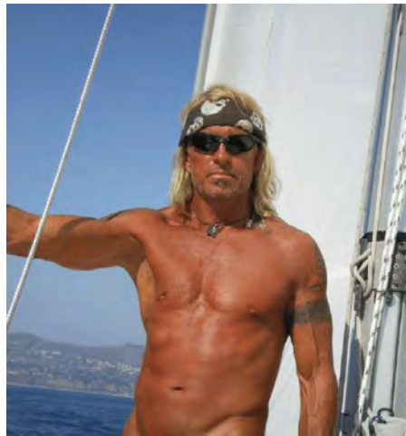
Art, at the sails.