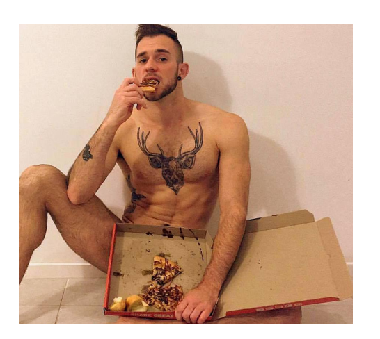
Issue 137 — May 2018 — Page 6 of 10