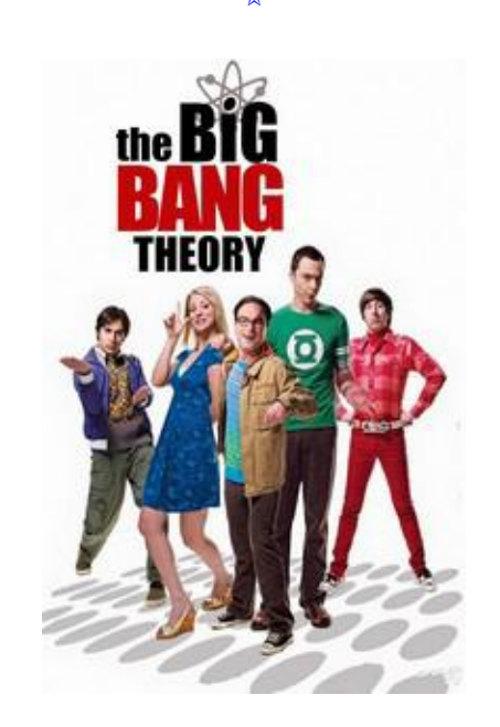
Every Thursday, 7:30-10pm

You're welcome to look at my own cut for an example of my work (and hopefully I've done it recently and it's not gotten shaggy).