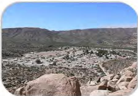
DeAnza Springs Resort from hilltop

☞ More events for May to be announced by mid-April.