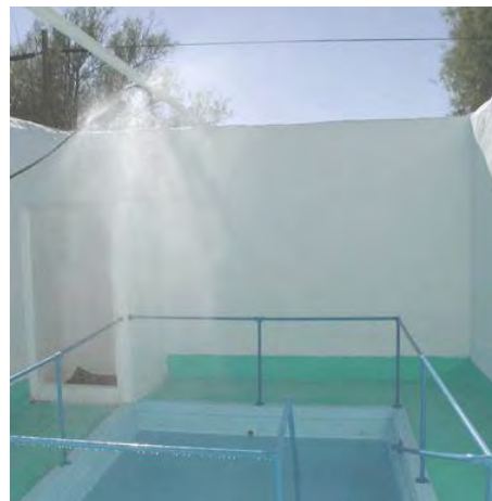
One of the open-sky baths at Delight's

Besides the really wonderful soaking waters in Tecopa (feels very soft, & kinda "silky", even though it's really very hard water), there's other things to see & do, like: Hiking, visit ghost towns, see the Death Valley wild flowers, the Death Valley Museum in Shoshone (nearest town to Tecopa, about 10 mi.), visit the China Ranch Date Farm (yummy date shakes & other date confections, tours, etc), and you can also go soak in the outdoor hot spring pool, or soak in the bentonite clay mud pits.