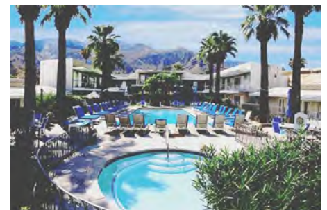
Canyon Club Hotel - Inside View

Please RSVP no later than Tuesday, March 24.