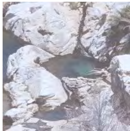
Deep Creek Hot Springs Pool

Camping near the springs is not permitted, and so not suggested for this trip.